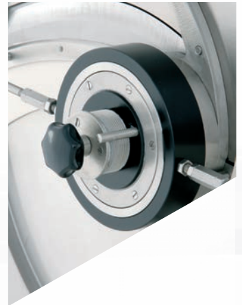
Range of tools for a variety of infinitely variable cuts