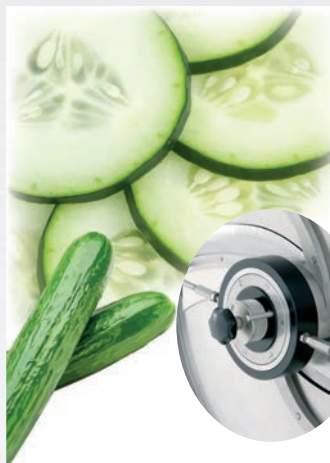
Curved blade disc, adjustable 0.5 to 25 mm 335607

Slice cutting of e.g. cucumber, carrots, celery, onions, potatoes, herbs