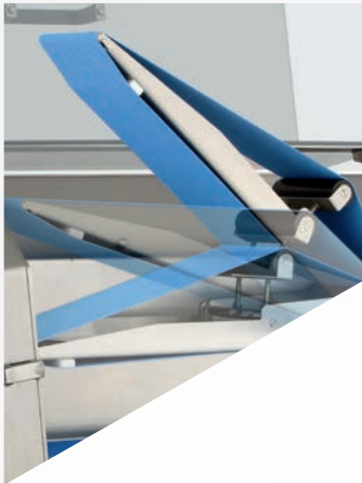
Setting of upper conveyor belt according to product