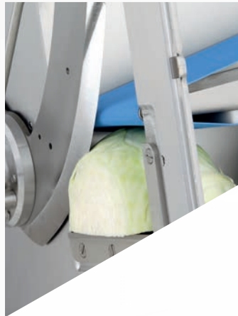
Gentle-touch cutting device ensures precise for clean cuts