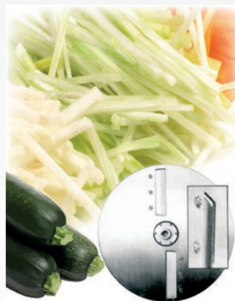
Strip cutting disc 2,5 x 2,0 mm Juliennes 334327 3,5 x 3,0 mm Juliennes 334328 4,5 x 4,0 mm Juliennes 334458 7,0 x 7,0 mm 335603 Strip cutting of e.g. carrots, turnips, radish