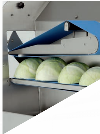
Only coarse pre-chopping required thanks to generous in-feed width