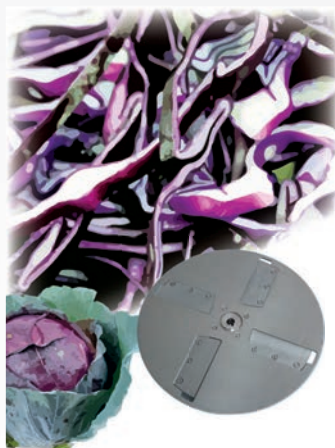
Slicing disc with for knives 1,3 mm 334333 3,0 mm 334334 4,0 mm 334332

Strip cutting e.g. salad, china cabbage, savoy