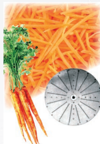
Shredding disc including supporting disc 3 mm 335762 4 mm 335763

Shredding of e.g. celery, radish, Potatoes