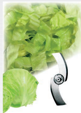
Open two-bladed knife, stainless steel, up to 90 mm cuts 334325

Slice cutting of e.g. cucumber, carrots, celery, onions, potatoes, herbs