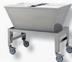
Mobile preparation tables with four lockable castors and cutting board for two to four work spaces 2 work spaces 335618 4 work spaces 715 031 000