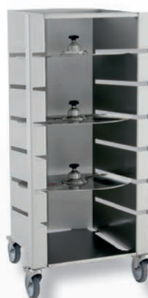
Mobile knife stand for 6 discs 335485

Shredding of e.g. celery, radish, Potatoes