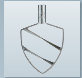
Stirrer, stainless steel