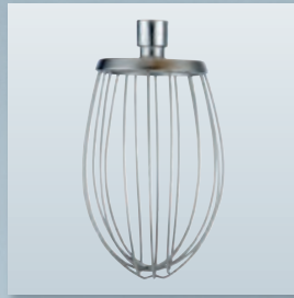
Beating whisk, including stainless steel wires 2.5 mm