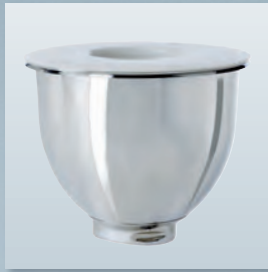
Stainless steel stirring bowl stackable and fitted with white plastic lid