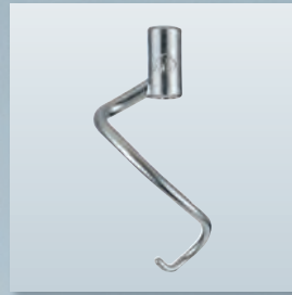
Kneader, stainless steel